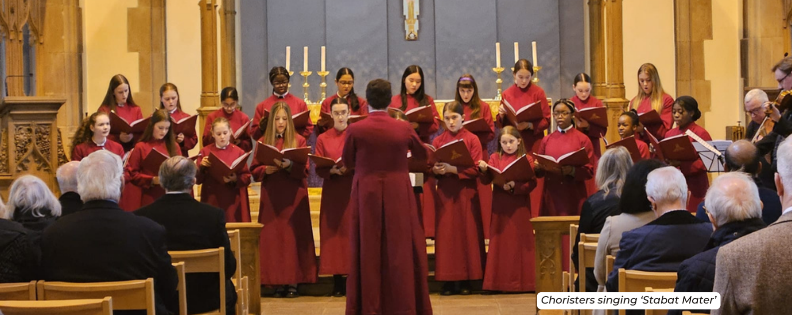
Choristers singing 'Stabat Mater'