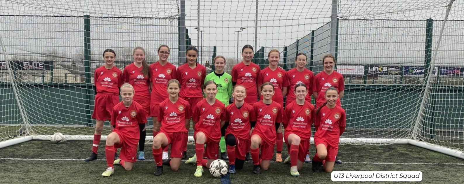
U13 Liverpool District Squad