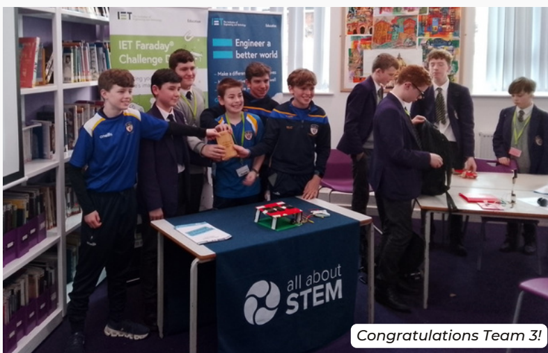
Congratulations Team 3!

Team 3 were the winners of this year's challenge!