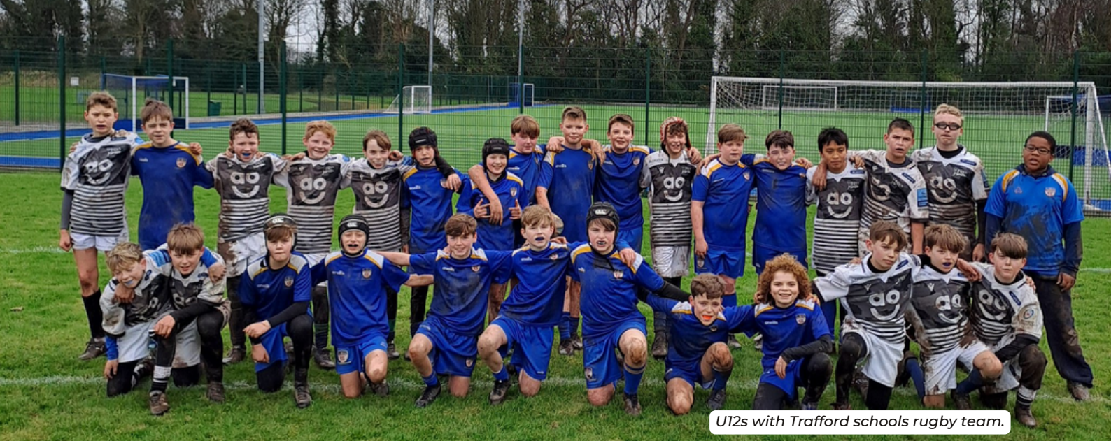
U12s with Trafford schools rugby team.