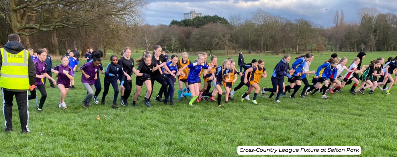
Cross-Country League Fixture at Sefton Park