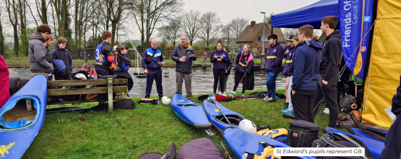
St Edward's pupils represent GB.