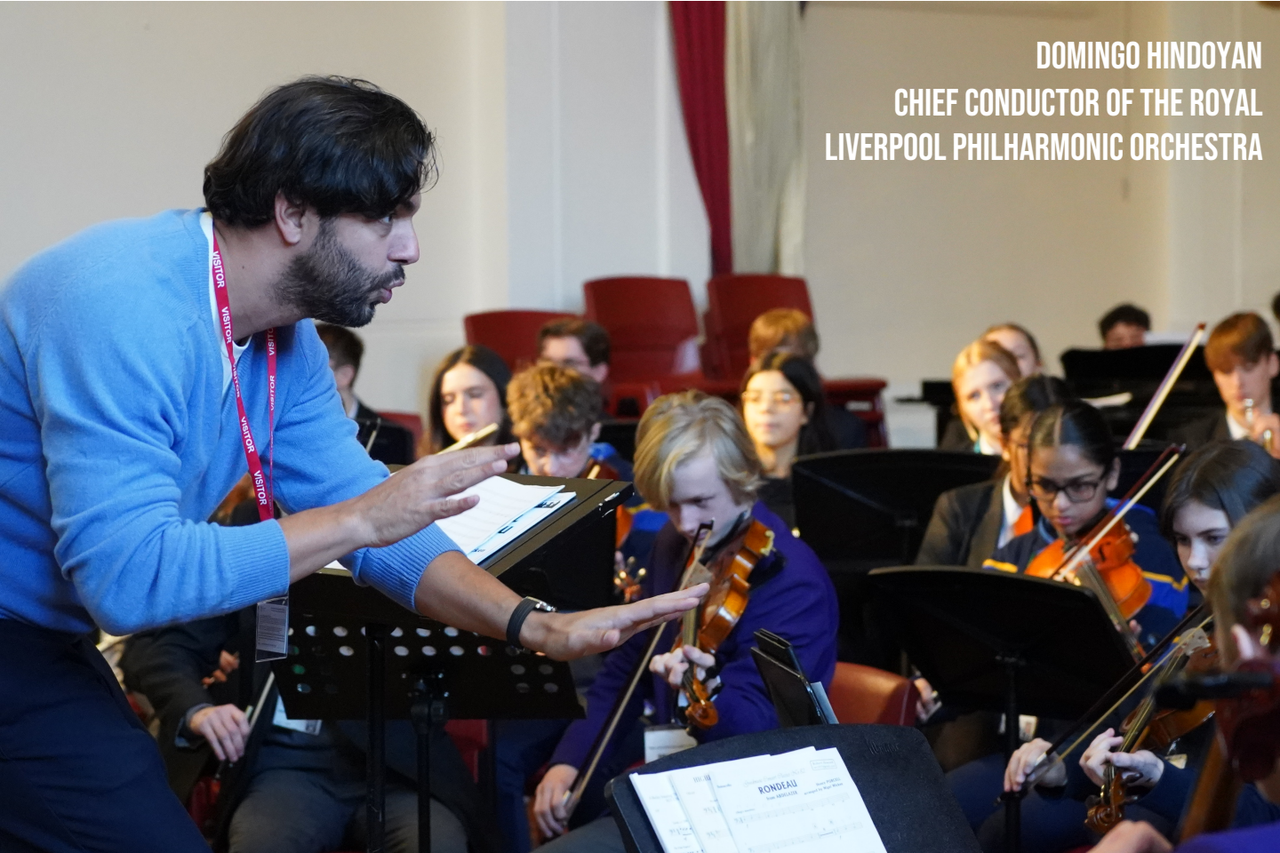
DOMINGO HINDOYAN CHIEF CONDUCTOR OF THE ROYAL LIVERPOOL PHILHARMONIC ORCHESTRA